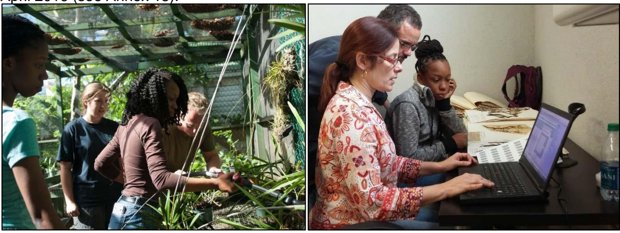
Figure 3. Training sessions for NPTVI staff: Nursery management session at J.R. O'Neal Botanic Gardens (L) and Brahms database session at SJ herbarium (R).

by the Puerto Rican Bank Plant Conservation Task force (<u>http://herbaria.plants.ox.ac.uk/bol/prvi</u>) which convened a workshop and meeting on 18 & 19 April 2016 (see Annex 13).