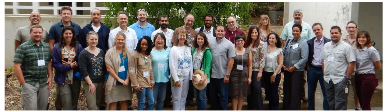
Figure 8. Puerto Rican Bank Plant Conservation Task force workshop participants on 19 April 2016 at FLMM.

A key outcome of this project – threatened species conservation strategy – has helped to embed good environmental decision-making, a key strategic priority for the BVI Government, by providing current species distribution and population size data for the BVI National GIS. This, inturn, provides the opportunity for planning applications to be compared with threatened species locations and management or mitigation recommendations to be made.