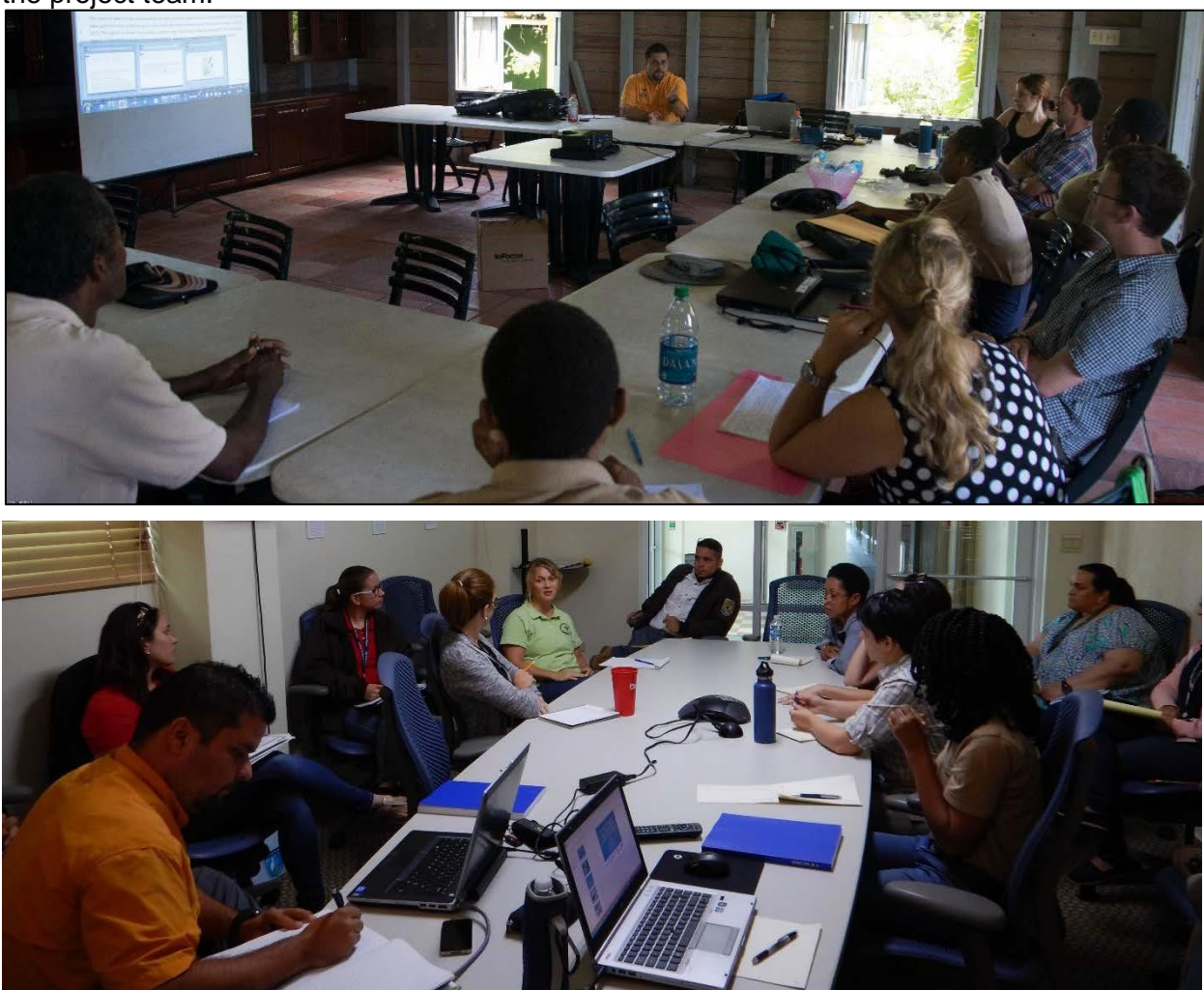
Figure 10. Project partners meetings: June 2015, J.R. O'Neal Botanic Gardens, Tortola, BVI (Top); April 2016, US Fish and Wildlife Service Office, Cabo Rojo, Puerto Rico (Bottom).

for tracking project progress between project meetings (see Annexes 8, 10, 11, 13 and 14) during the life of the project. This system enabled the project team to learn, adapt and make informed decisions to maximise the impact of the project (and ensure value for money). The work plan itself was a living document that was updated during the project, as necessary (see section five above). This worked very well for a project of this size and would be used again in the future by the project team.